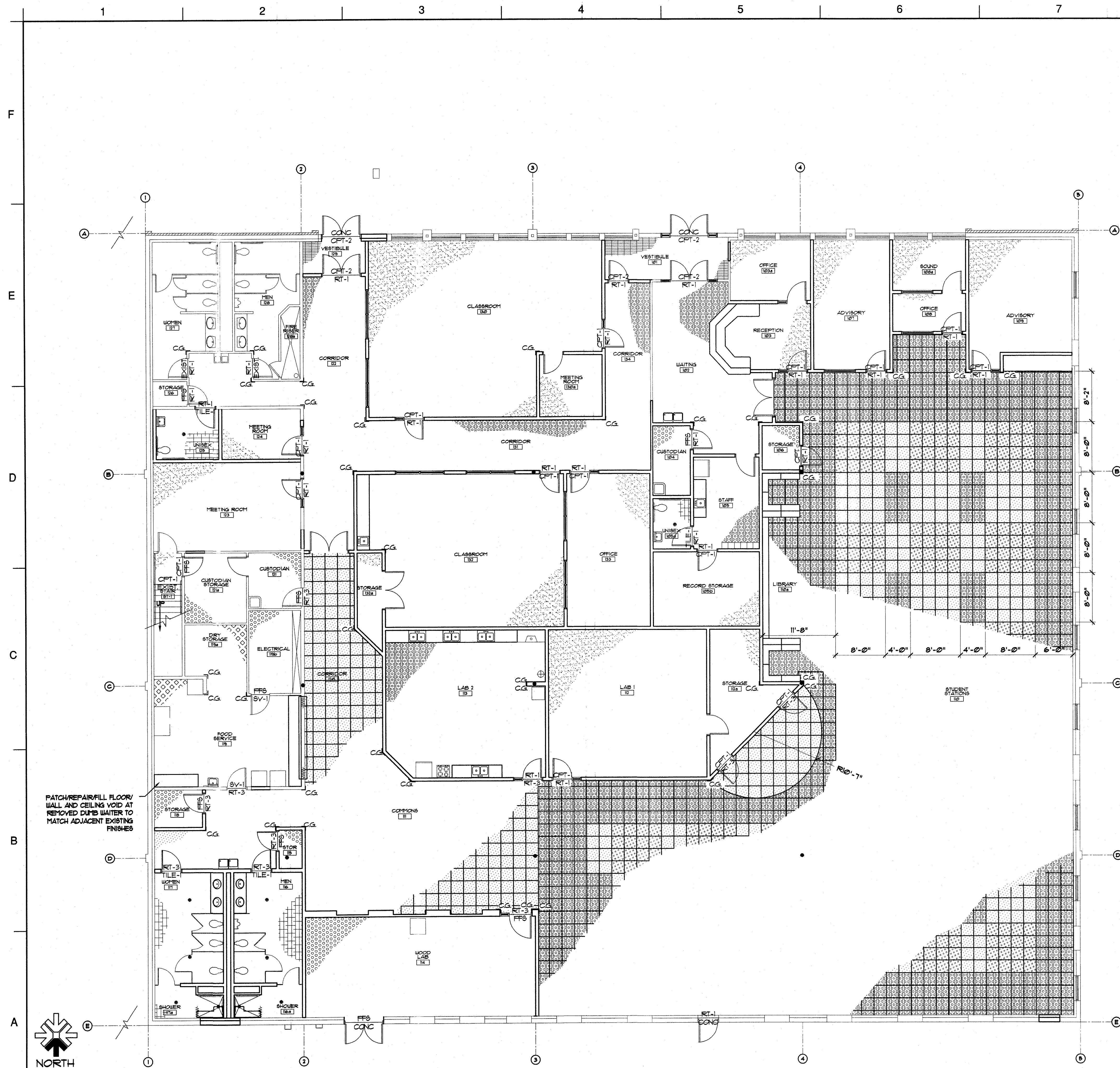
A1 FIRST FLOOR PLAN